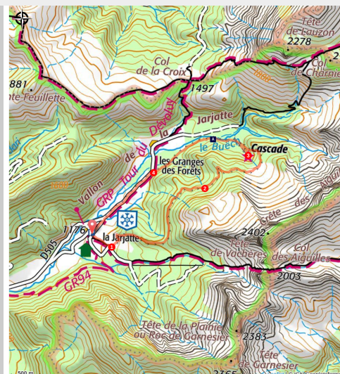
Cascade de Mougious

For a few kilometers discover the natural resources of the valley of Jarjatte, a magnificent site classified by the state since 2012, for the recognition of the picturesque of this place and the work done by all the local actors for its safeguarding.