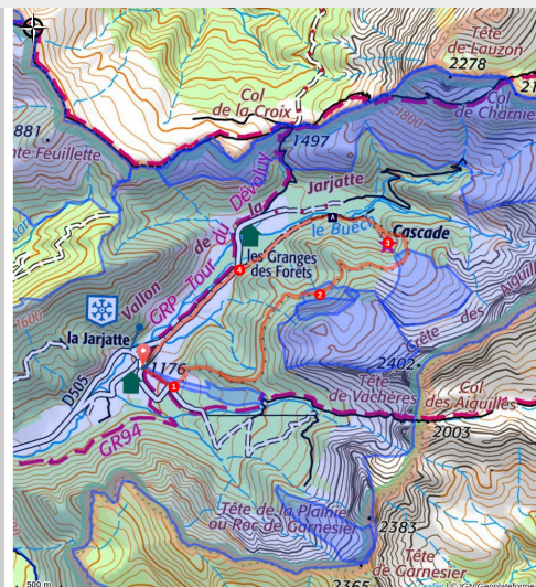
Cascade de Mougious

For a few kilometers discover the natural resources of the valley of Jarjatte, a magnificent site classified by the state since 2012, for the recognition of the picturesque of this place and the work done by all the local actors for its safeguarding.