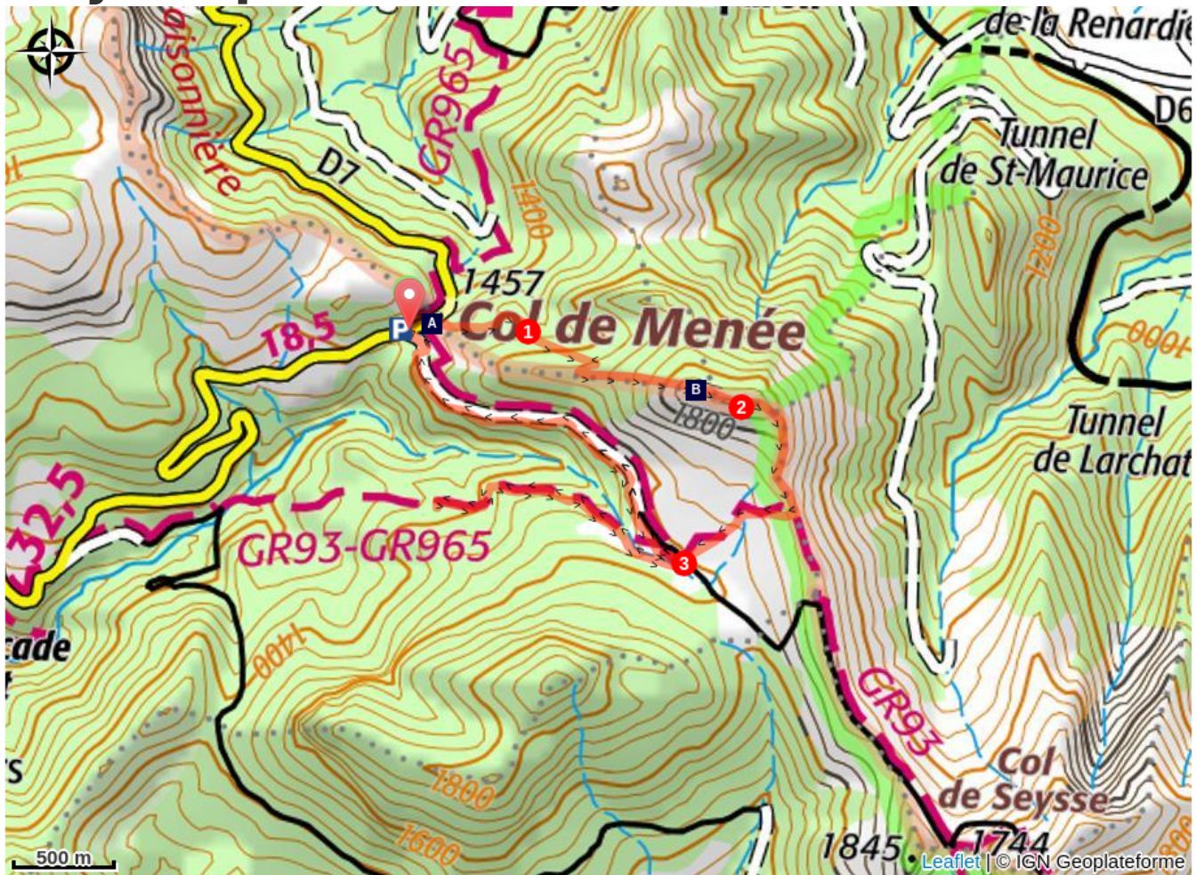
Col de Menée (A)