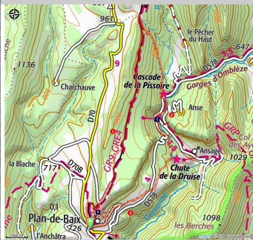
Plateau du Vellan (m_rocheblave)

The plateau du Vellan is a place of great ecological, patrimonial and landscape diversity. This walk offers you the opportunity to discover in a few kilometers many riches of the valley of the Gervanne, including the famous and remarkable Gorges d'Omblyze.