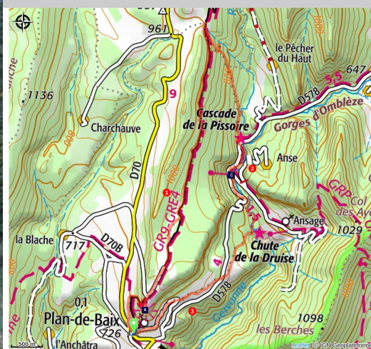
Plateau du Vellan (m_rocheblave)

The plateau du Vellan is a place of great ecological, patrimonial and landscape diversity. This walk offers you the opportunity to discover in a few kilometers many riches of the valley of the Gervanne, including the famous and remarkable Gorges d'Ombrière.