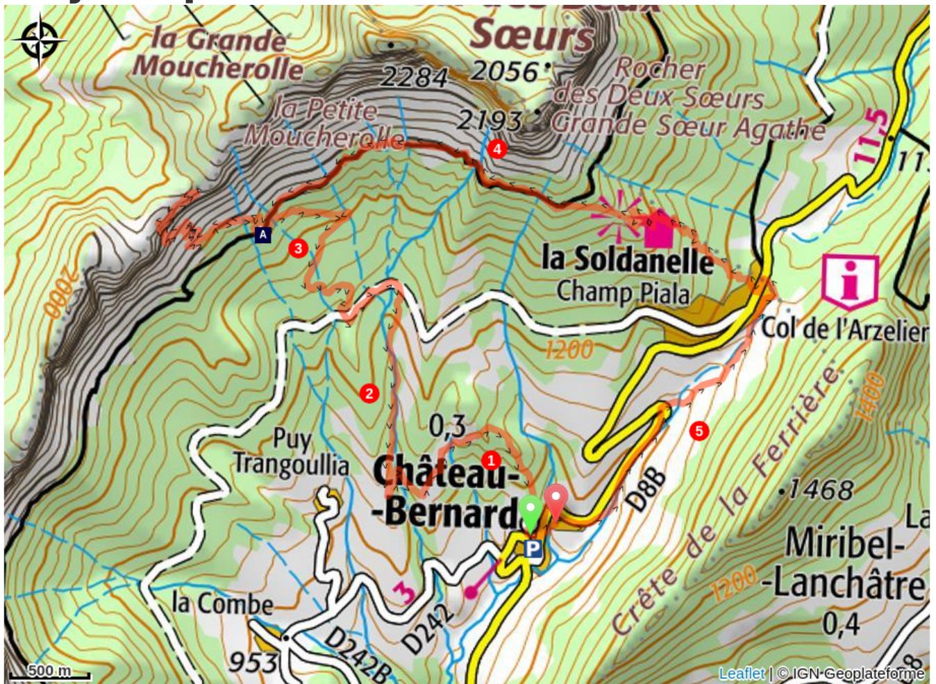
Tétras Lyre (Black Grouse) (A)