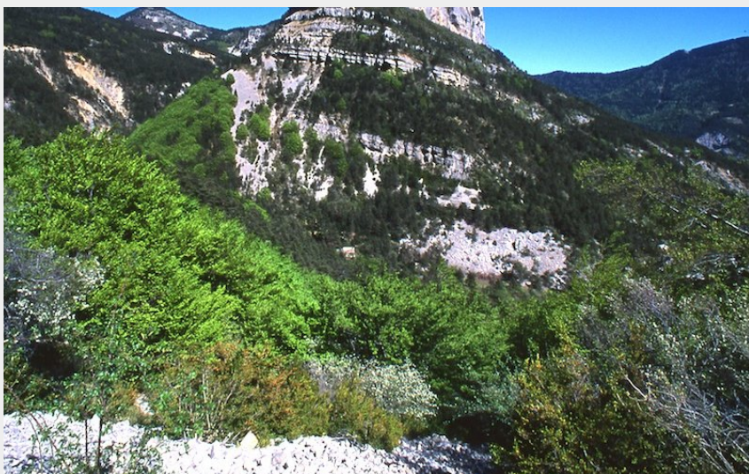
Le rocher de Combau (D. Oddoz)