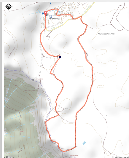
Balade en famille sur le sentier du Karst (E. Charron)

The Karst trail is set up by the Departmental Council of Drôme on land owned and managed by it as a sensitive natural area, accompanied by a small explanatory booklet available in neighboring tourist offices.