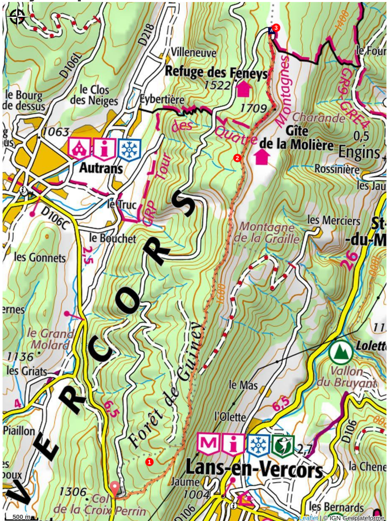
Viewpoint of the Molière (A)