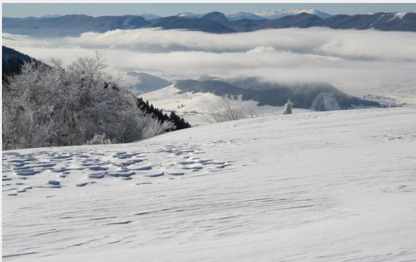
Plateau de la Molière (V.Giry)