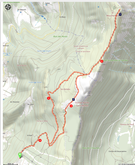
Au sud du Moucherotte (S.M Booth)

An emblematic route for the Grenoble inhabitants. The view of the Moucherotte is magnificent. One of the most beautiful views of Grenoble and its surroundings.