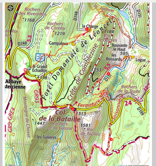
Le Plateau d'Ambel (PNRV)

For the more sporting enthusiasts of mountain bike, this complete and varied circuit is cut out for you!