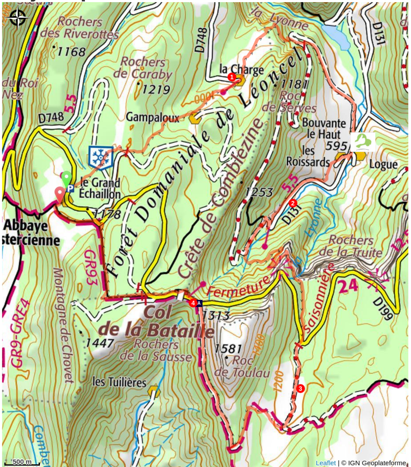
Col de la Bataille (A)