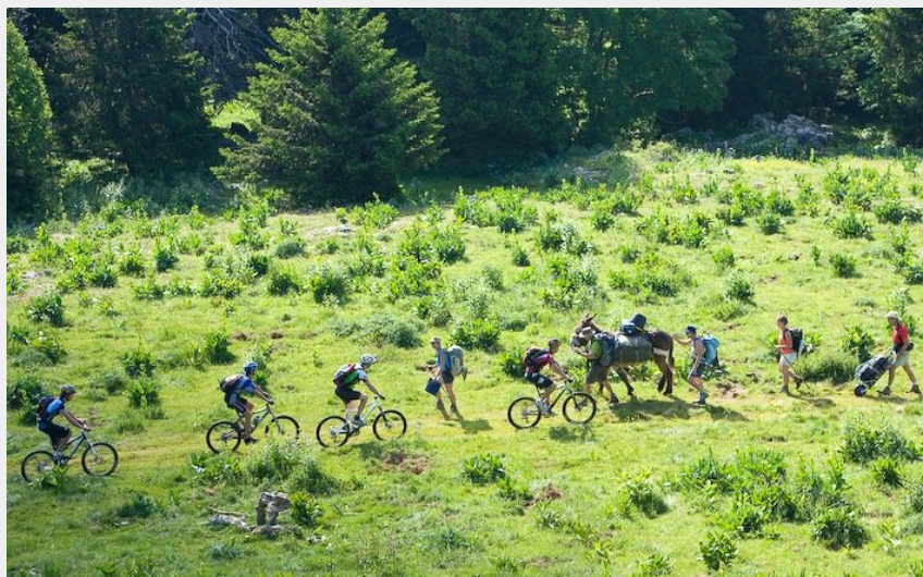
Le Plateau d'Ambel (PNRV)