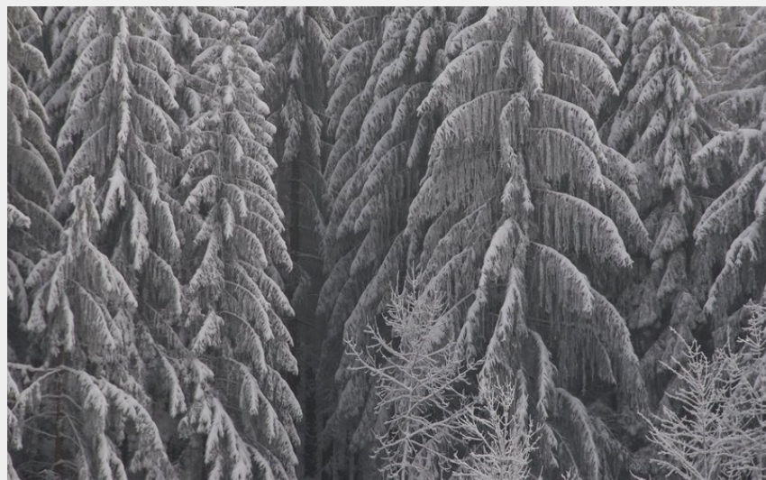
Forêt enneigée (F Da Costa)