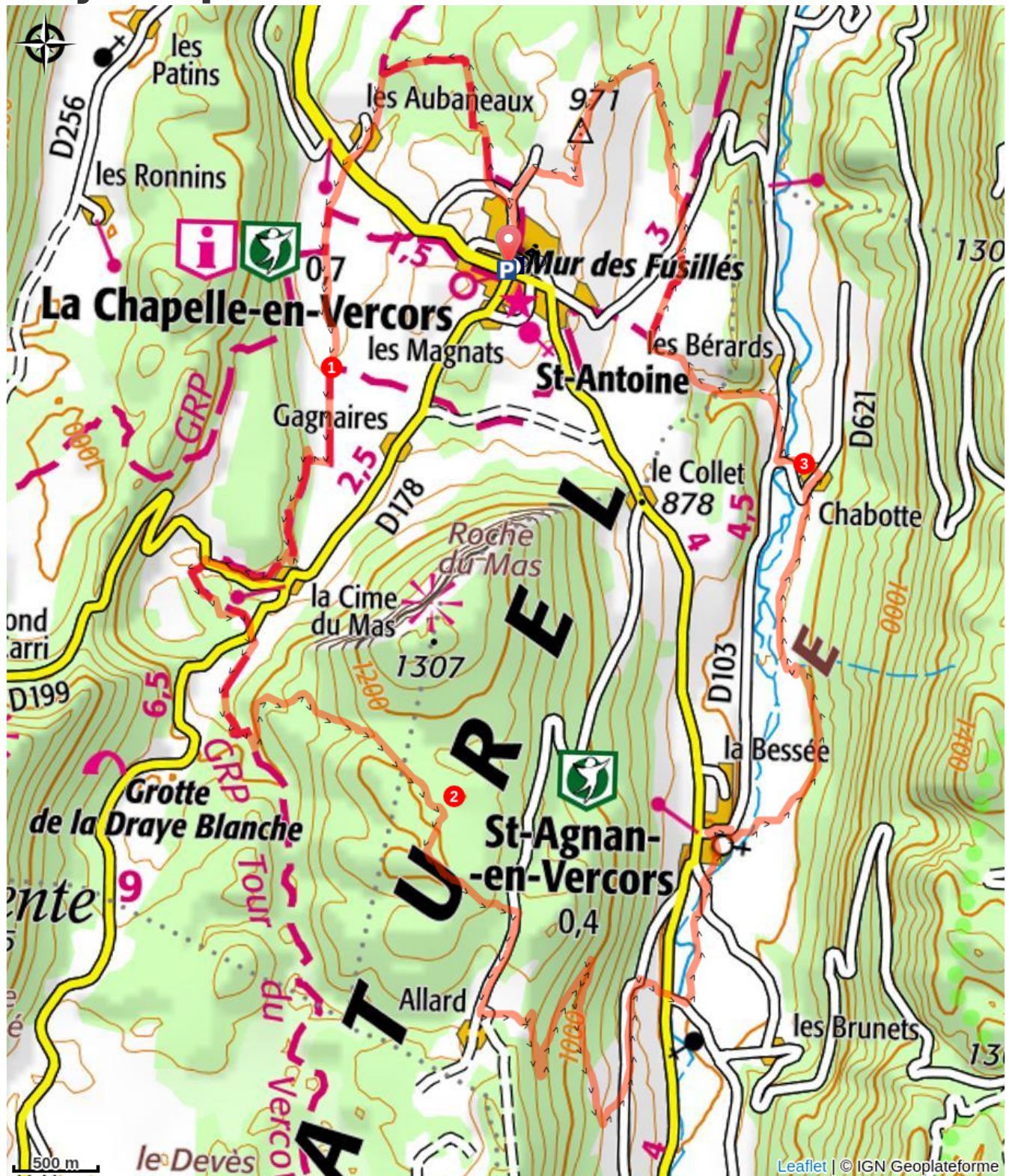
The reconstruction of the village (A)