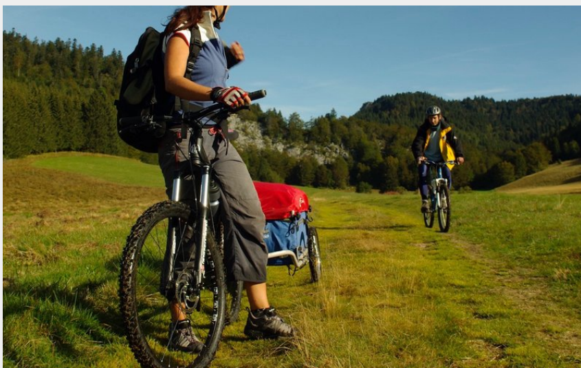
Balade VTT en famille (PNRV)