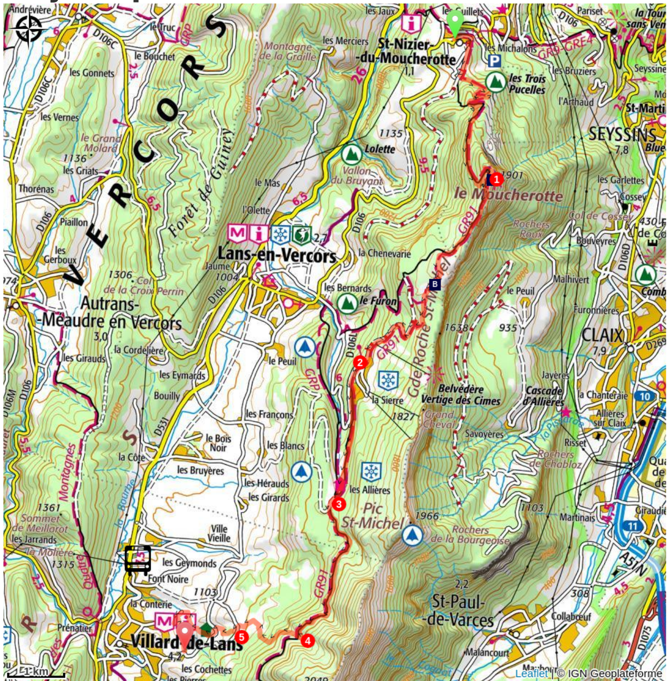
Summit of Moucherotte (A)