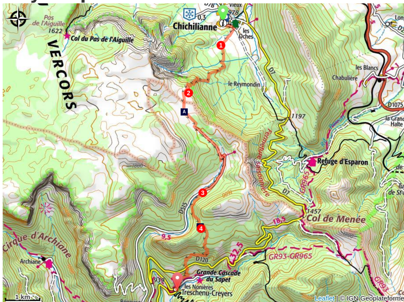
Cabane of Essaure (A)