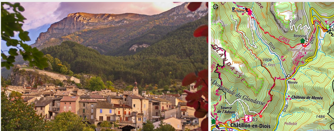
Village de Châtillon-en-Diois (OT_Diois)

At Archiane, take the time to explore the vulture discovery trail, a great opportunity to learn about these giants of the sky that soar above the massif!