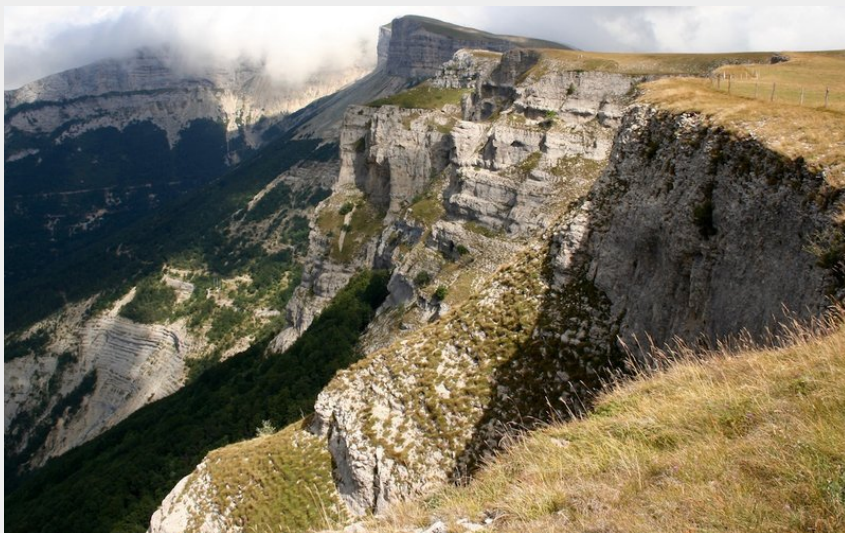
Impressionnantes falaises de Font d'Urle (v_giry)