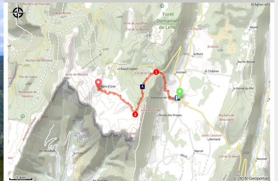
Crête des Gagères (ot_Vercors Drôme)