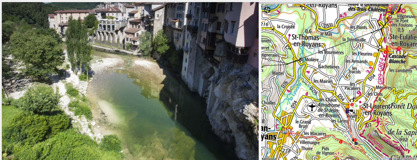
Maisons suspendues de Pont-en-Royans (S&M_Booth)

With its houses suspended above the river Bourne, Pont-en-Royans is one of the most famous villages in the Dauphiné. A Water Museum is located in the heart of the village.