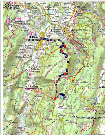
Belvédère de Combe Laval (S&M_Booth)

A stage dedicated to contemplation and a chance to catch your breath. Take the opportunity to marvel at the listed site of Combe Laval from the belvedere of the same name. Also worth seeing are the cave and waterfall of Frochet just before you reach the village of Saint-Jean.