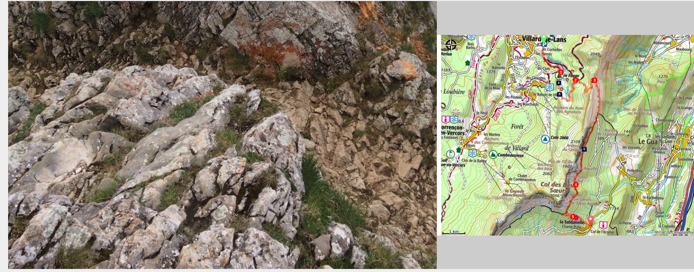
Le franchissement du col Vert (y_buthion)