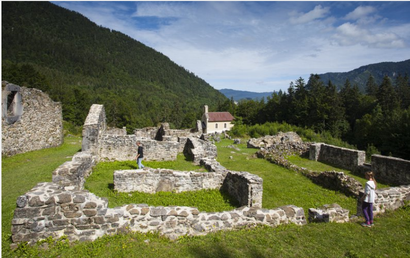
Valchevrière (S&M Booth)