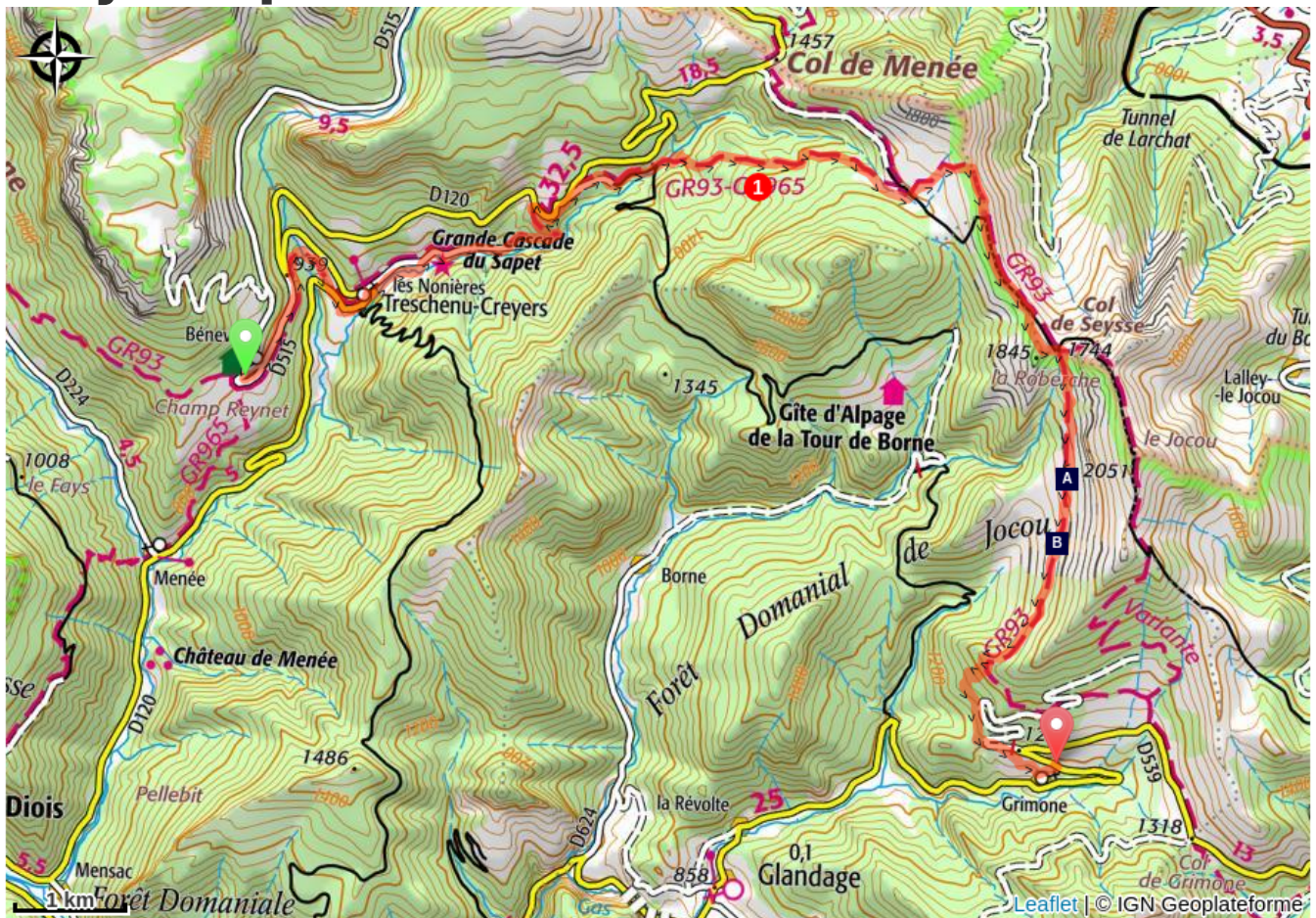
Pasture of the Jocou (A)