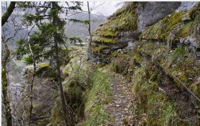
Chemin en balcon (PNRV) (admin)