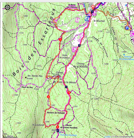
Monument du 45 ème parallèle (admin)

Go to the symbolic monument representing the passage of the 45th parallel (bronze edifice), you will be exactly halfway between the North Pole and Ecuador!